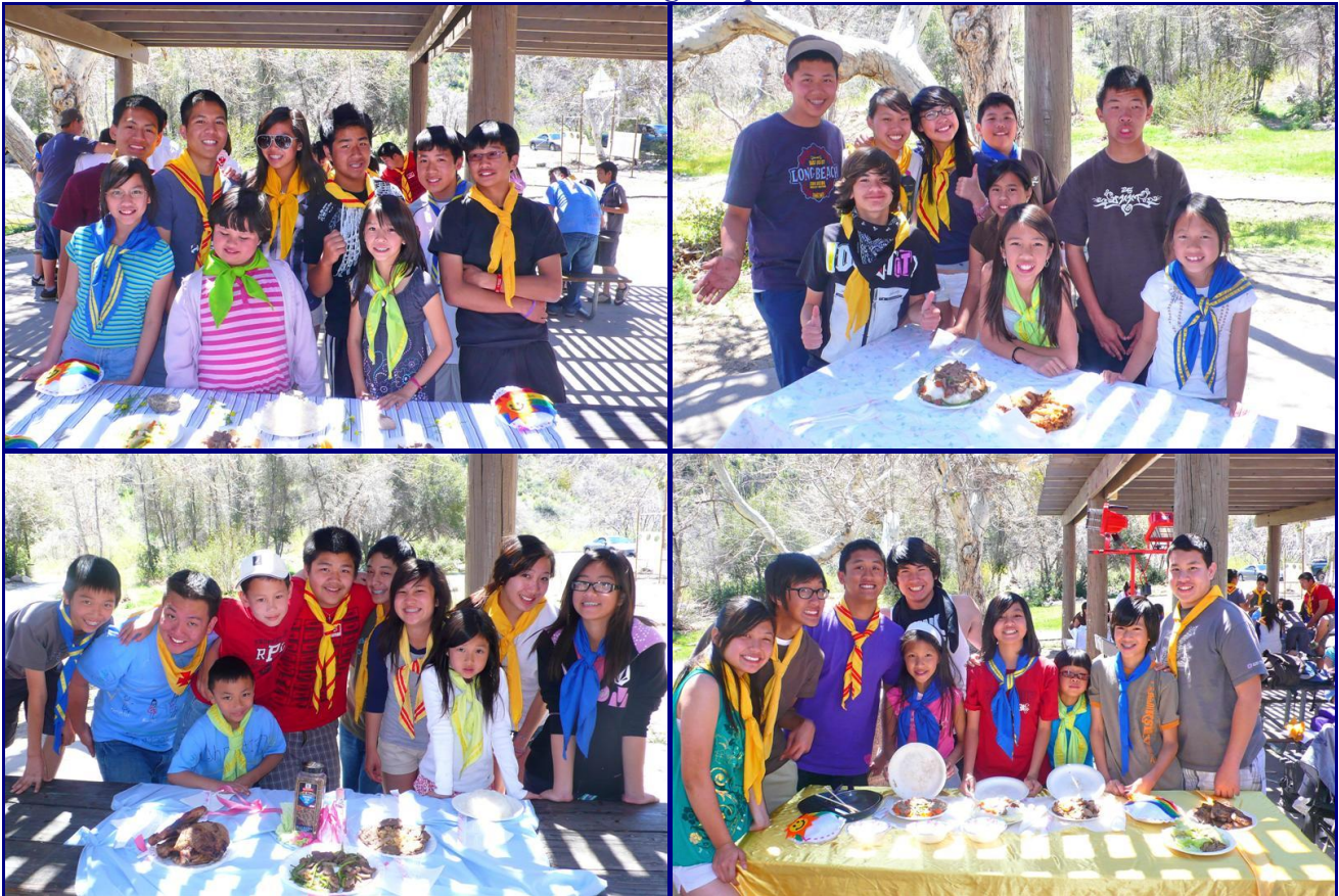
“Look Ma, we can cook!”

“Please come to see our gourmet and yummy dishes. We wish you were here with us.”