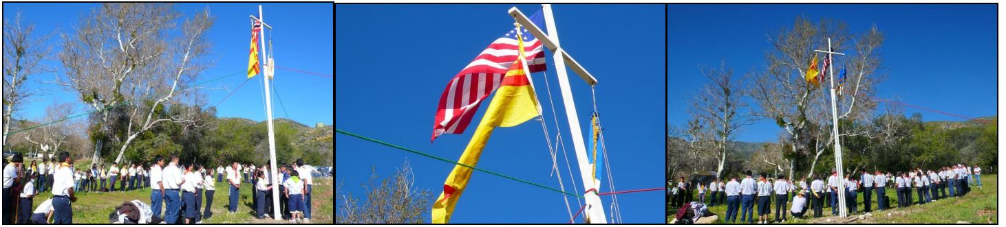
Morning assembly under the flags

Fr Long was very supportive and brave without exception to come up to the camp at night in the cold and slept overnight preparing for the early morning Mass. The Sunday Mass filled the troops with the divine spirit in the natural settings of the beautiful springtime nearby the lake. The homily from the shepherd was motivational and practical for the young ages.