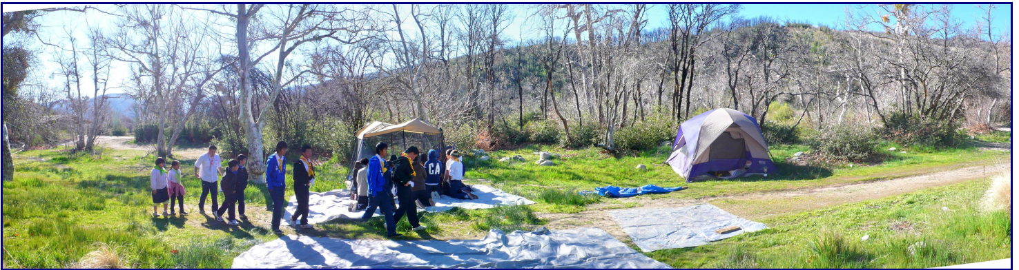
Walking past the Eucharist tent during prayer's gathering

More than 70 troopers signed up for the trip, plus the Huynh Truong, Tro Ta and Phu Huynh to make up about 80 strong participants for the Camp this early spring time at Silverwood Lake.