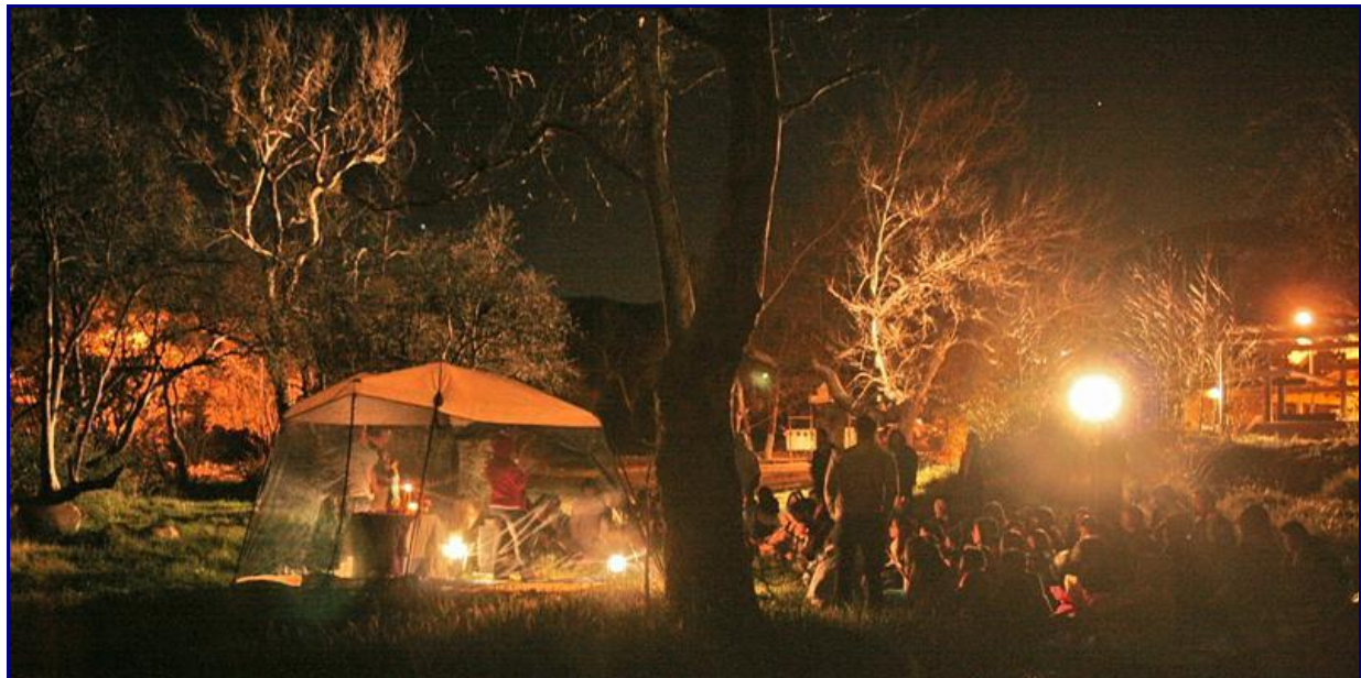
Praying at the Eucharistic tent under the cold night

Thanks to some Phu huynh responding to the calls and came up to the camp to help out, mostly in the areas of cooking and serving to relieve the inrush during meal times; as the numbers of Tro Ta had remained the same and became overwhelmed with the services and needs in the camp year after year, and marginalized the welfare of the troops.