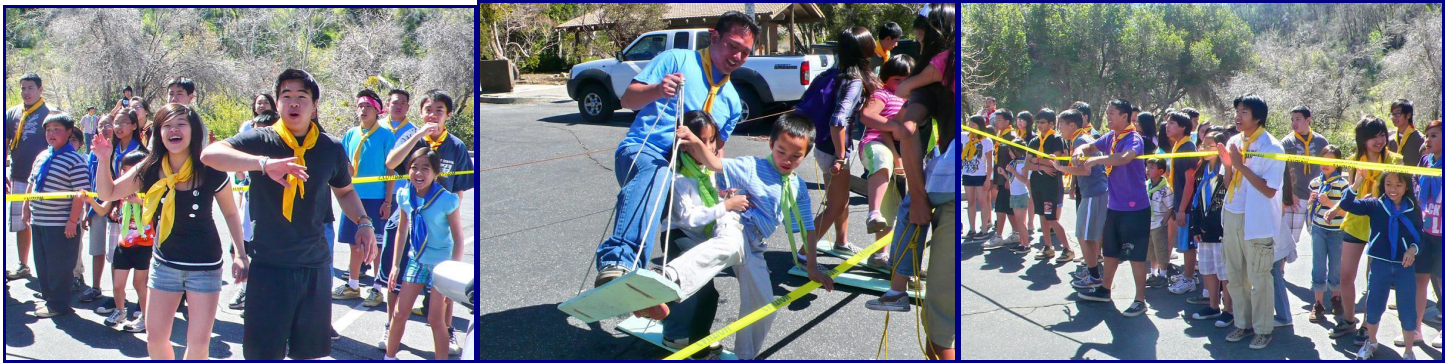
Go! GO.....GO .....GO!!!

I want to specially thank you to the followings for a wonderful sacrifice you made at our Doan Camp: (I know that did more then listed but that is all I can remember, so please forgive me)