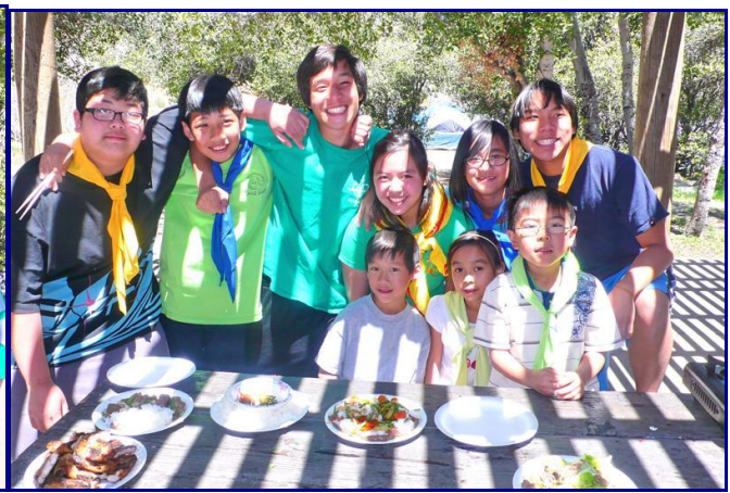
“My chef buddies in the team kitchen”