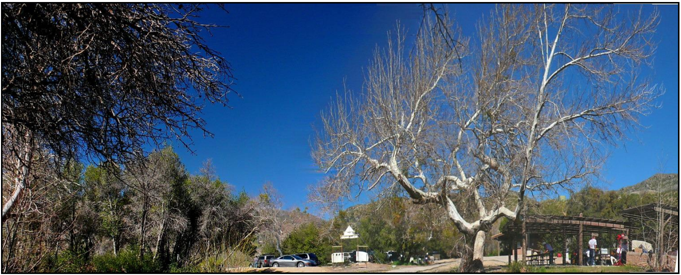
Beautiful springtime at the TNTT Camp XXVI

Thanks to some Phu huynh responding to the calls and came up to the camp to help out, mostly in the areas of cooking and serving to relieve the inrush during meal times; as the numbers of Tro Ta had remained the same and became overwhelmed with the services and needs in the camp year after year, and marginalized the welfare of the troops.