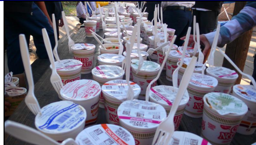
“Ma! Standard camp foods were just as good when hot foods were not available.”